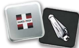
Metal Gift Box

Unique notched design provides the kind of snug fit that only a flat wrench can.