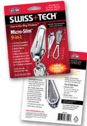
Environmental Clamshell English Package